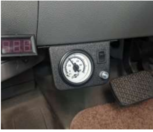
AirLift control panel below steering wheel