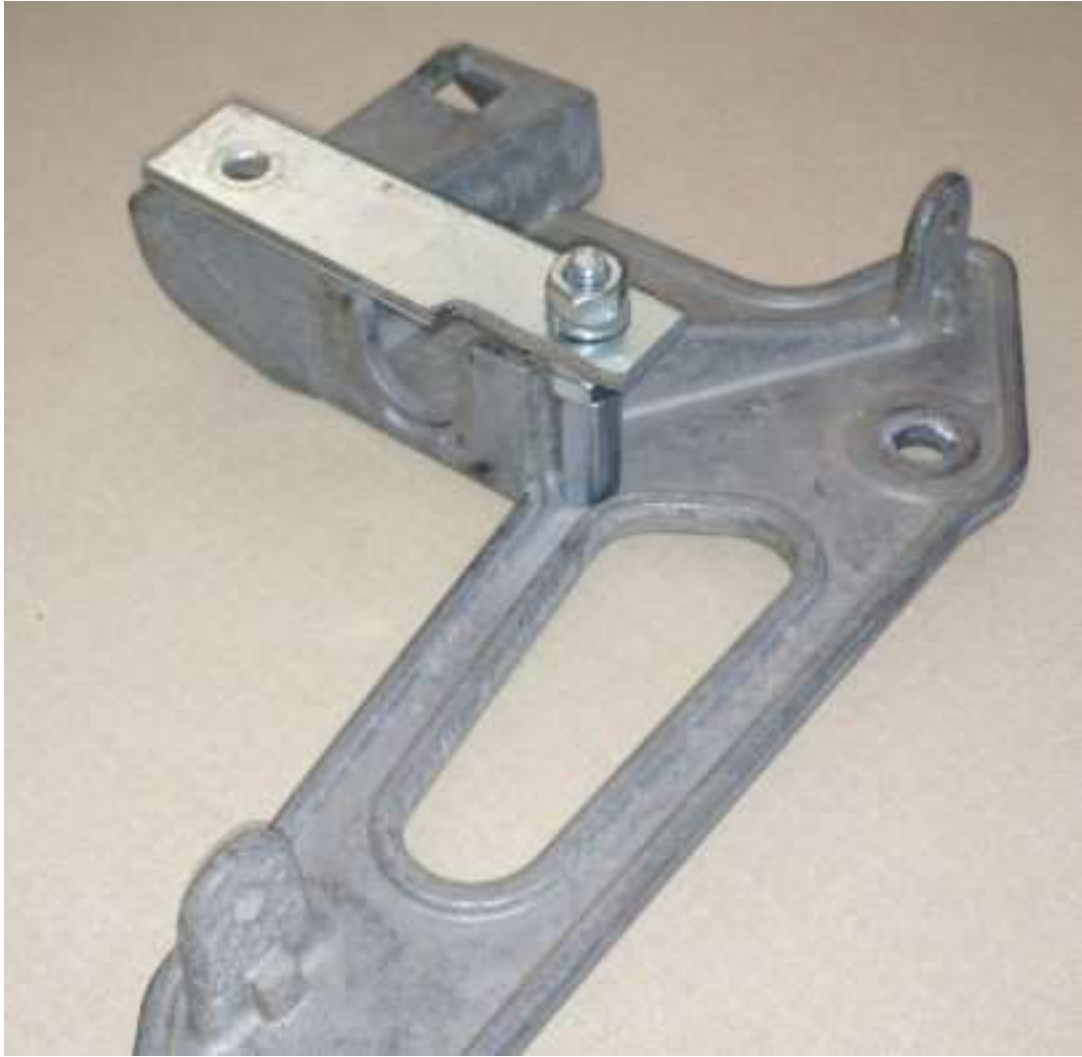
All put together... a simple fix...