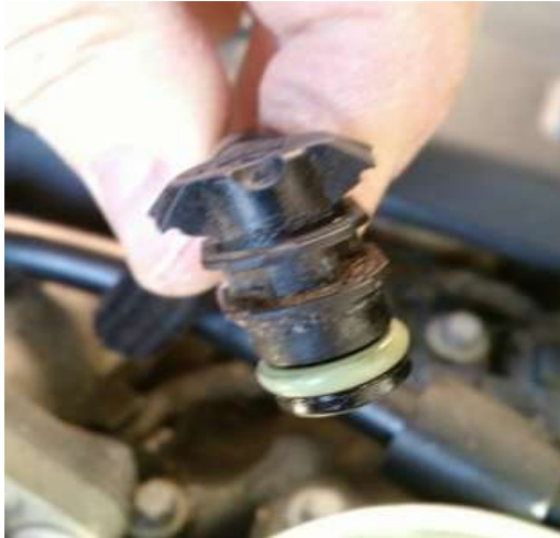
This is the damaged part...