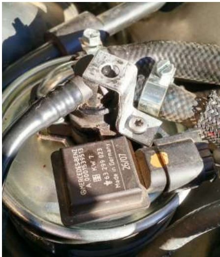
Here is what it looks like when attached and held in place by one of the screws on the WIF sensor.